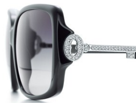
The Optical Gallery has all the keys to seeing the best, all while looking the best in our new Tiffany & Co® Eyewear!

The Optical Gallery has been working very hard this season to bring in some of the newest couture eyewear. Some of the new brands you are likely to see our own opticians showing off include: Vera Bradley, Bvlgari, and Tiffany & Co. We offer spectacular new designs and colors in so many of our brands, that it’s worth a visit. As a reminder, an appointment is never necessary to come in and check out a new frame or pair of sunglasses. And of course, with the holidays just around the corner, a new stylish pair of glasses is always a great stocking stuffer, as the glare of the sun on the snow can be so prevalent in our snowy seasons.